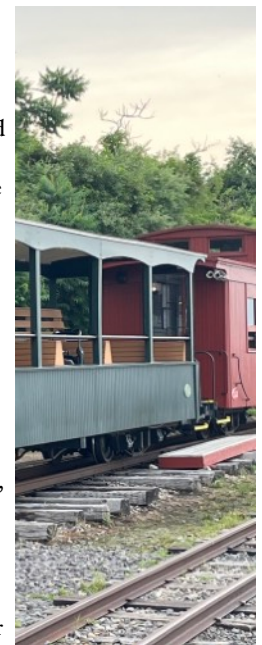
Coach Car & Caboose