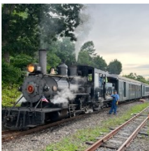
Our Train for the Ride

In the August newsletter, I talked about the Conway Scenic Railroad in North Conway, NH. The CSR was one of the stops on our summer trip to Vermont, New Hampshire and Maine. As we worked our way to the coast of Maine in enroute back to Boston, we stopped in Portland, ME. There we visited the Maine Narrow Gauge Railroad.