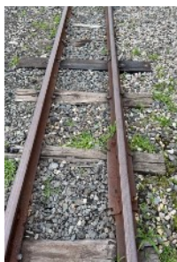
The 2-Foot Gauge