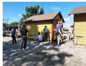
Scouts painting motor car sheds