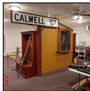
Another view of center display