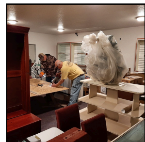
Work on displays