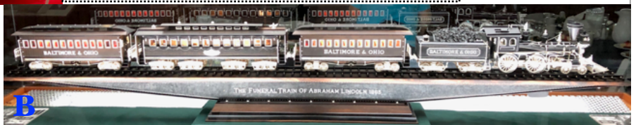
Photo B - This is a carving of Abraham Lincoln's funeral train that took the President's body from Washington D.C. back to Illinois.