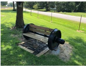
New bench next to the 1023 at the museum grounds